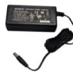
Led power supply